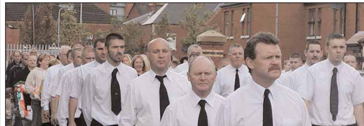
Future Unveiling Events:

When we look at this memorial and when people think of the dead volunteers we should also spare a thought for the families of the same volunteers. They have had much pain to endure, sorrow to bear and grief to contend with.