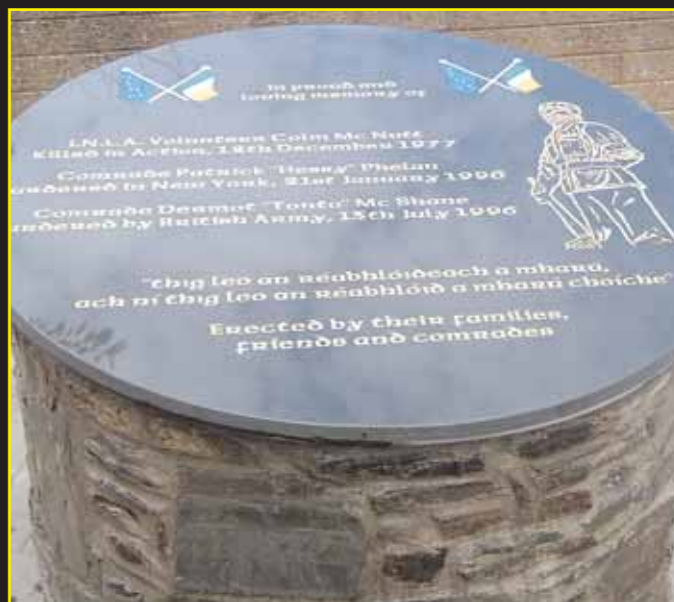
Above: The new plaque which was unveiled in Derry's Bogside in tribute to three friends who were all killed in separate but equally tragic circumstances and below: the IRSM colour party stands in formation behind the new memorial.

The ceremony ended with representatives of the Kevin Lynch Memorial Flute Band playing the national anthem.