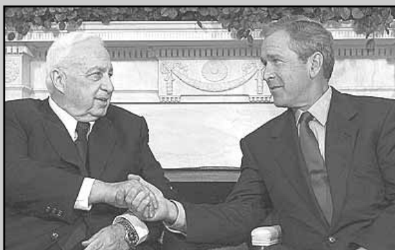
Bush's Road Map is nothing more than an expansion of US economic and political interests.

Importantly, however, this Road Map differs from the previous