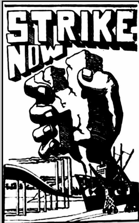
Poster calling for workers action during the Political Status protests over twenty years ago in the H-Blocks of Long Kesh. Workers unity is needed now to avert another tragic loss of life inside a British gaol in Ireland.